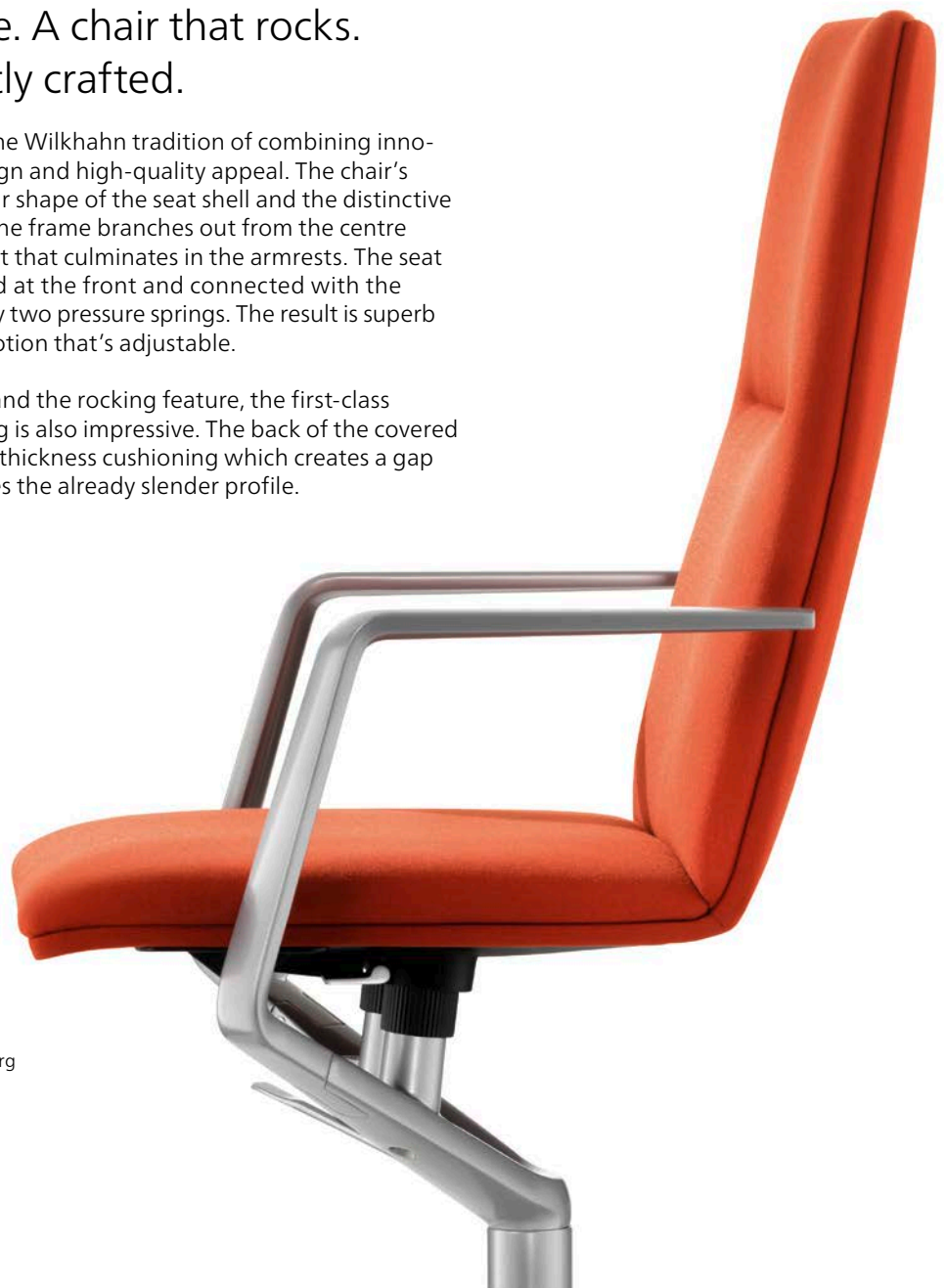
Sola Design: Justus Kolberg

In addition to the clear design and the rocking feature, the first-class craftsmanship of the cushioning is also impressive. The back of the covered plywood shell includes double-thickness cushioning which creates a gap all the way round. This enhances the already slender profile.